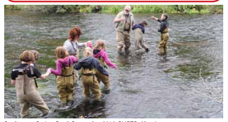
Students at Spring Creek September 2010.

Jen Luke (Jennifer.a.luke@state.or.us or 541 633-1113)