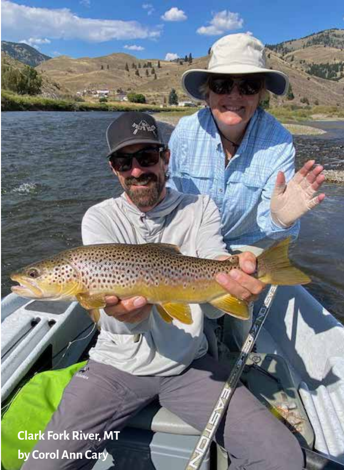
Clark Fork River, MT

return to the hatchery ponds without making a trip to the ocean thru Bonneville Dam). There was also a higher percentage of jack salmon (fish returning after only one summer in the ocean) from the larger smolt size group. The smaller smolt size group actually returned a greater number of 2 ocean fish (60% increase ) than the larger smolts due to the greater number of smolts that were raised in the fixed size of the hatchery ponds. When extended to 4 year old fish (3 ocean fish) the advantage became even greater with a 150% increase for equal cell size populations.