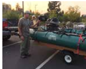
Gary Davis showing his new trailer.

COF East Lake Outing next July and actually open up an afternoon to try out each other's boats, on the water, in advance of the Tri-Tip Roast dinner. Stay tuned for more details to come.