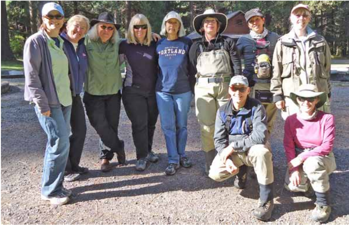
Wild Women of the Water on the Metolius River.

fish. Students will meet COF volunteers at Big Bend Campground at 2:30 p.m. Students will fish from 2:30 p.m. to about 4 p.m. It would be good to have one volunteer for every student. If you would like to help, let me know so we can set up a car pool. Thanks.