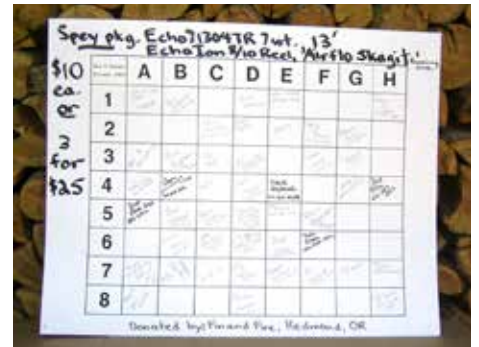
1 square for $10.00 or 3 squares for just $25.00

A winner can't be drawn until all the squares are sold. Bring your cash or check to the May 20th COF meeting and buy a square or three. Let's sell out the board and draw a winner on May 20th.