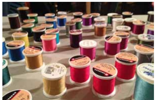
Rod-building class—colorful, creative and fun.