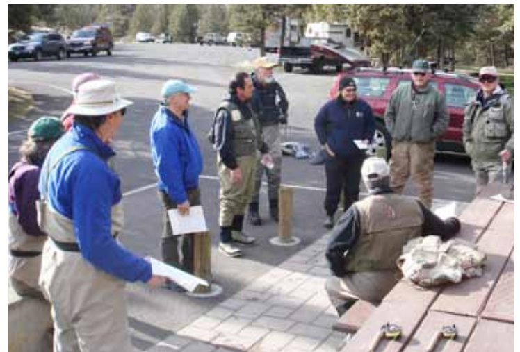
COF members gather at Big Bend Campground for the Crooked River outing.