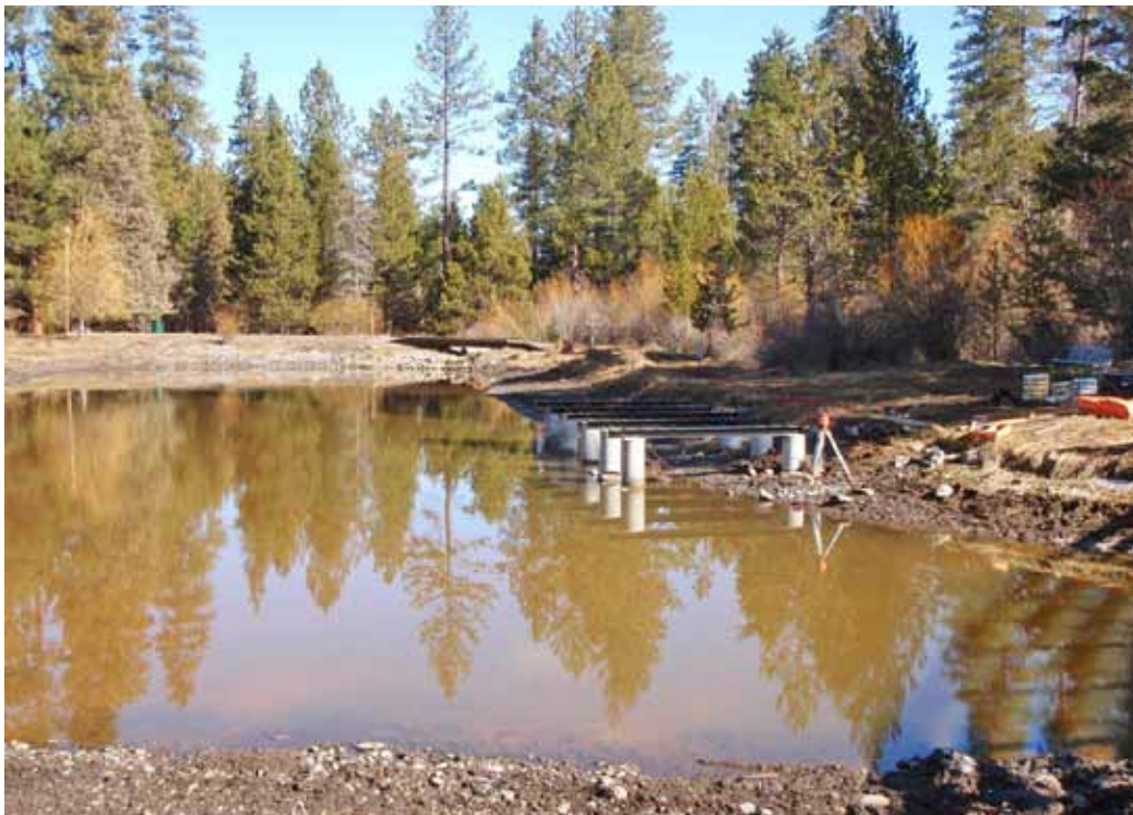
Handicapped access ramp under construction at Shevlin Pond.