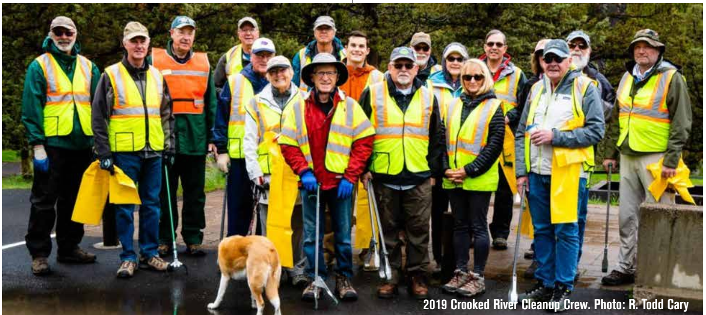
2019 Crooked River Cleanup Crew.

- PETER MARTIN PCMARTIN@BENDBROADBAND.COM