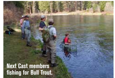
Next Cast members fishing for Bull Trout.

It's fishing time! The Next Cast members are turning sixteen and able to drive themselves to the water! On a recent sunny Wednesday afternoon (early release from school), this happened! Four local high schoolers hit the water, hard.