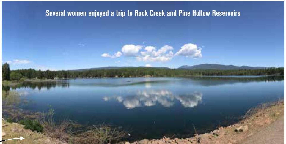
Several women enjoyed a trip to Rock Creek and Pine Hollow Reservoirs

There has been the help of a variety of stakeholders in the planning of the Ochoco Preserve. The Land Trust anticipates that