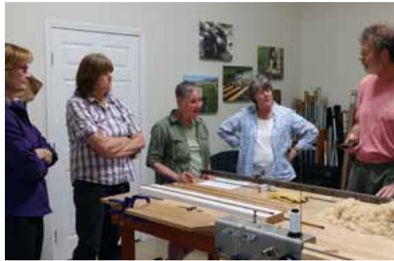
Bamboo Pursuits Discussing Planing