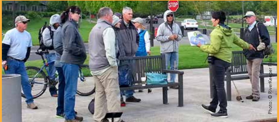
COF members attend introduction to the Old Mill Fly Casting Course

June 7, 14, 21 & 28/July 5, 12, 19, & 26, 2016-6:00pm