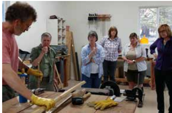
Bamboo Pursuits Splitting