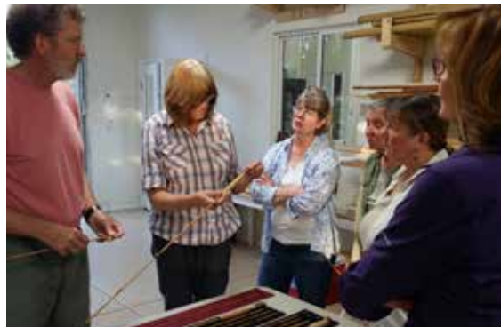
Bamboo Pursuits Examining Finished Rods