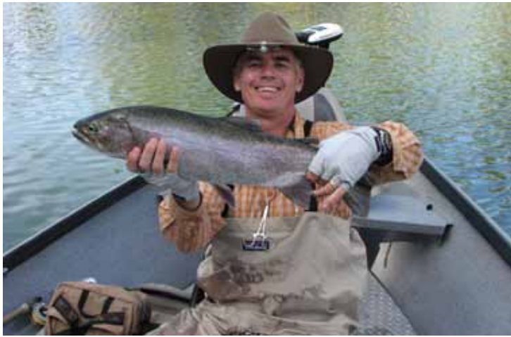
Here's a 27-inch fish from that day caught on the Williamson River.