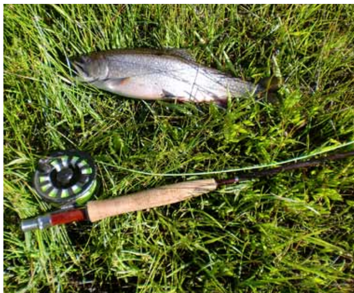
One of the few fish caught on the Chewaucan River during the June outing.

COME ON OUT FOR A DAY OF FUN, FLIES & FOOD!