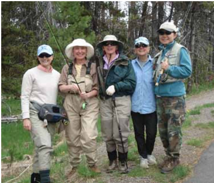
Wild Women of the Water on the upper Deschutes.