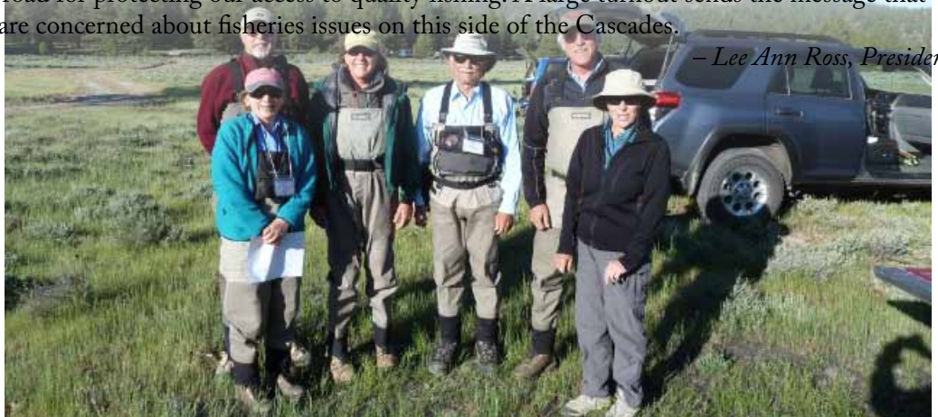
Outing to the Chewaucan River, June 2011.