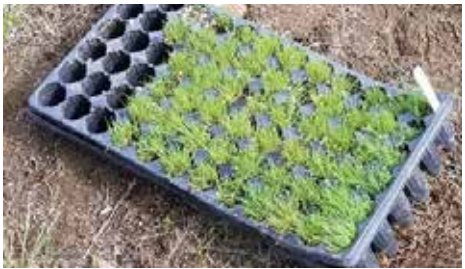
The flats of native bunch grass were planted in open areas and protected by deer tubes. Volunteers agreed to haul water to the native plants to help them get established in the next couple months.