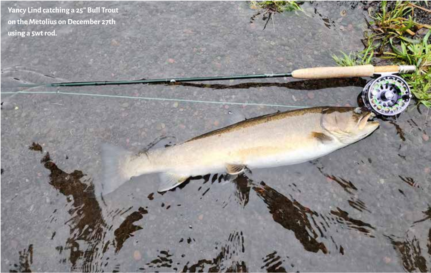
Yancy Lind catching a 25" Bull Trout on the Metolius on December 27th using a 5wt rod.