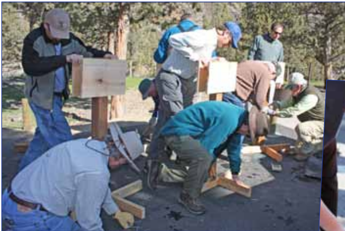
COF members, with assistance from Prineville High School students, assembled and placed educational signs along the Crooked River.