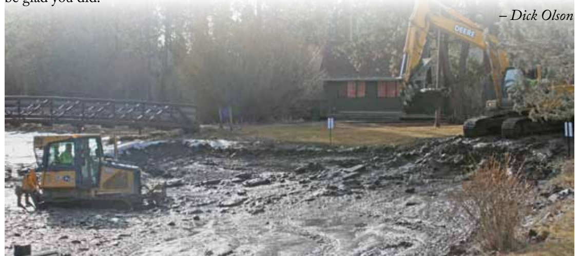
Dredging Shevlin pond to remove silt and improve fish habitat.