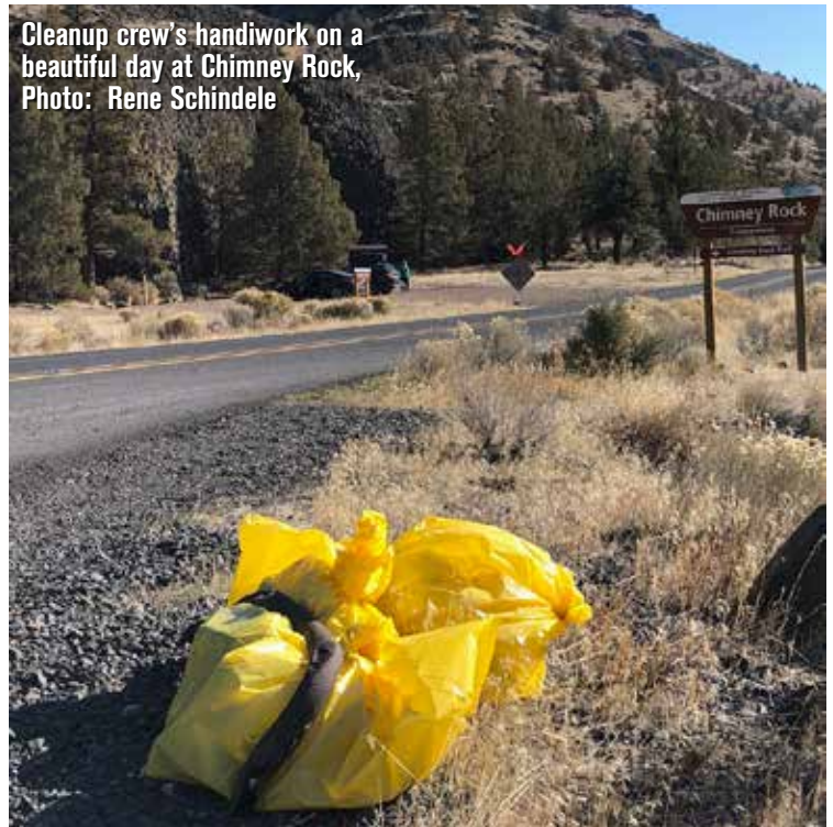
Cleanup crew's handiwork on a beautiful day at Chimney Rock, Photo: Rene Schindele