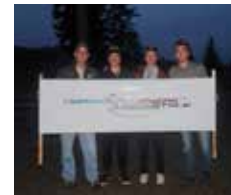
Joey and Fly Fishing USA youth team

A total of 12 teams registered and fished 5 lakes in 3 hour sessions for rainbow trout. Each lake produced a 23” fish, with the biggest over 27.5”! The total number of fish caught per lake were between 180–280!