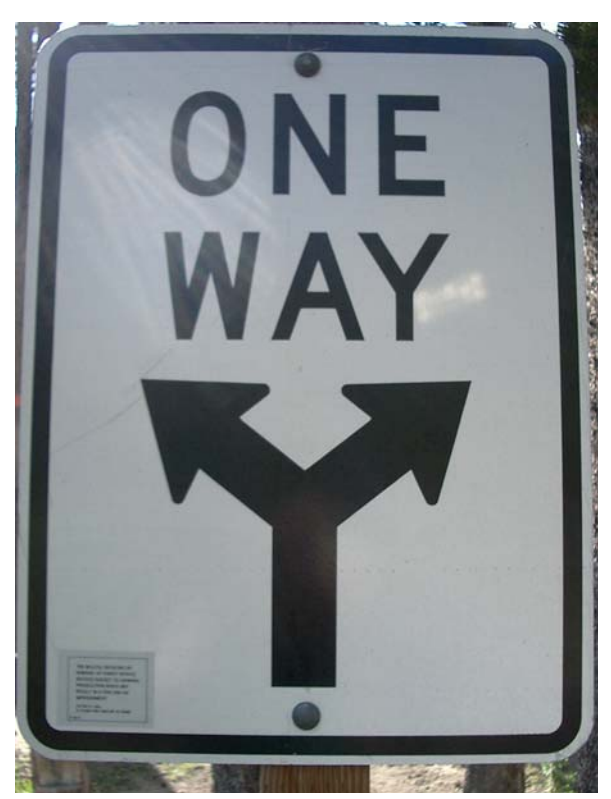
A Sign for Contemplation at Cinder Hill Camparound, East Lake

When the hatch is on, you are own your own, although callibaetis seem to be the most common and emergers work better that straight dun patterns. However, you need to watch out for mixed hatches, because although the callibaetis are always prolific, they are not always the insect of