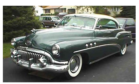
52 Buick, Alternate Tie

Wrap your oval ribbing over the seal fur and trim. Tie in another set of guinea fowl tips for the beard. Guinea tips should extend to the hook point. Tie in a strand of peacock herl, make 2 or 3 wraps, tie off, trim, and whip finish.