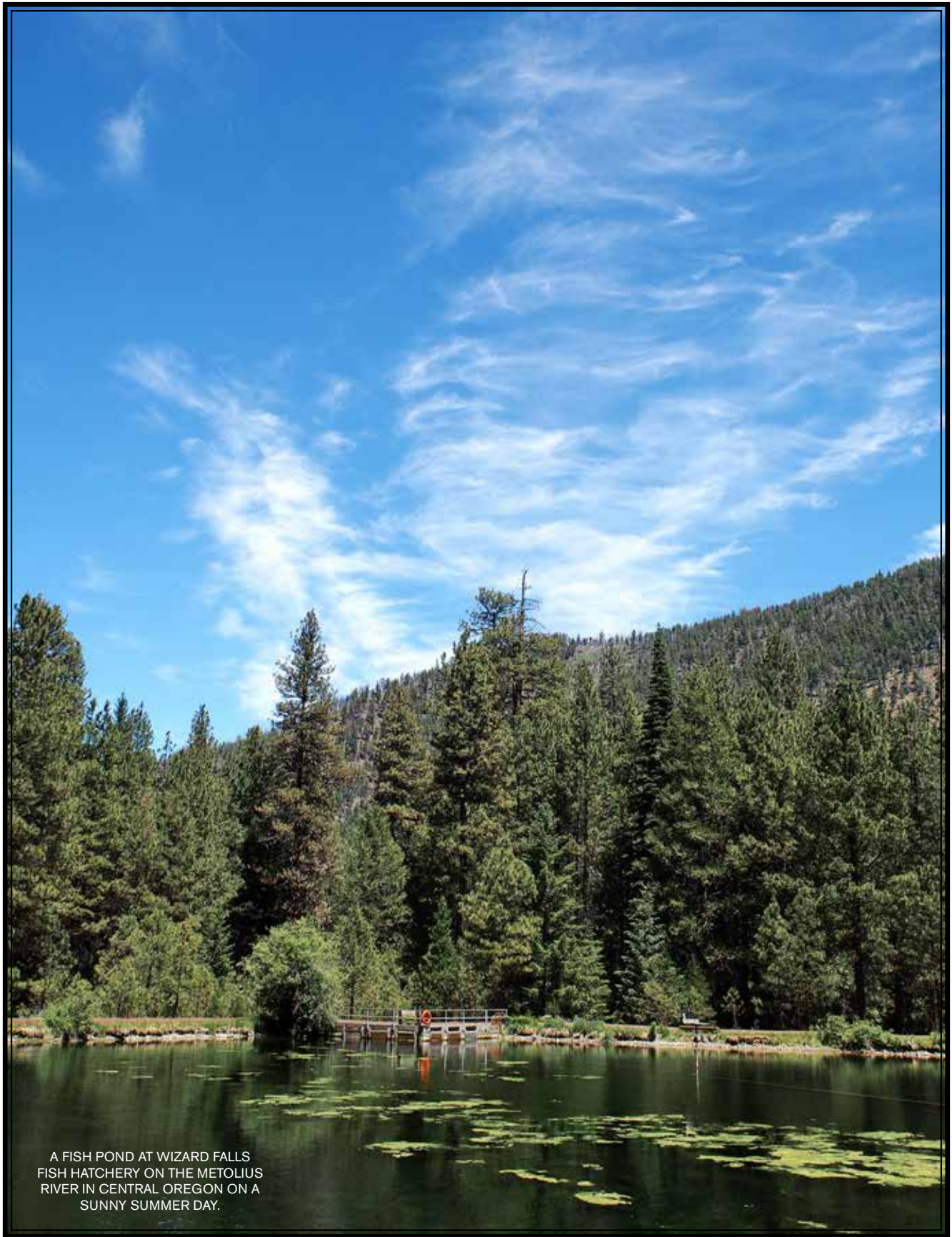
A FISH POND AT WIZARD FALLS FISH HATCHERY ON THE METOLIUS RIVER IN CENTRAL OREGON ON A SUNNY SUMMER DAY.