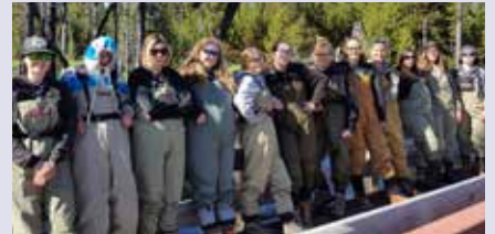
Local high school girls learn to fly fish on the Upper Deschutes.