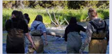
High school girls use kick nets to collect aquatic insects on the Upper Deschutes.