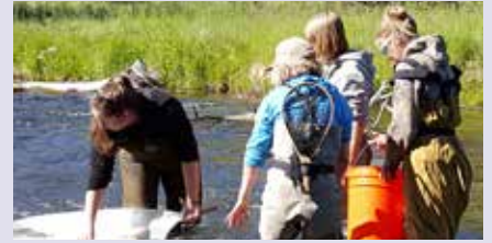
Wearing waders to play in the water was as much fun as fly fishing!