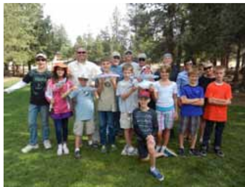
REALMS students after practicing casting. Everyone "caught" velcro fish with their accurate casting!

In October, classes will include casting at the ORVIS casting course, fishing at Bend Pine Nursery, and bug identification and macroinvertebrate studies in the classroom. Details for each week's classes are on the COF Calendar. Volunteers are needed for all of the classes. Please contact Karen Kreft (503-409-0148 or nextcast@coflyfishers.org ).