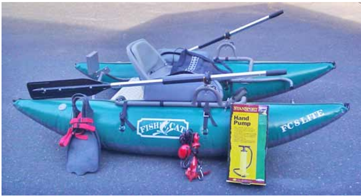
For a $10 purchase, you have the opportunity to win this Fish Cat pontoon boat and all the accessories.

Squares will be sold at the October meeting. If you cannot attend the October meeting but would like to buy a square, contact Debbie Norton (503-510-2767). We will draw the winning name once all the squares have been sold!