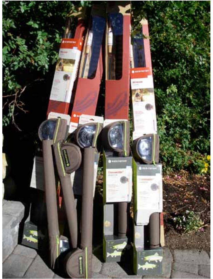
Thanks to Redington, COF was able to purchase 12 youth rods at a discount for the youth fly-fishing program.