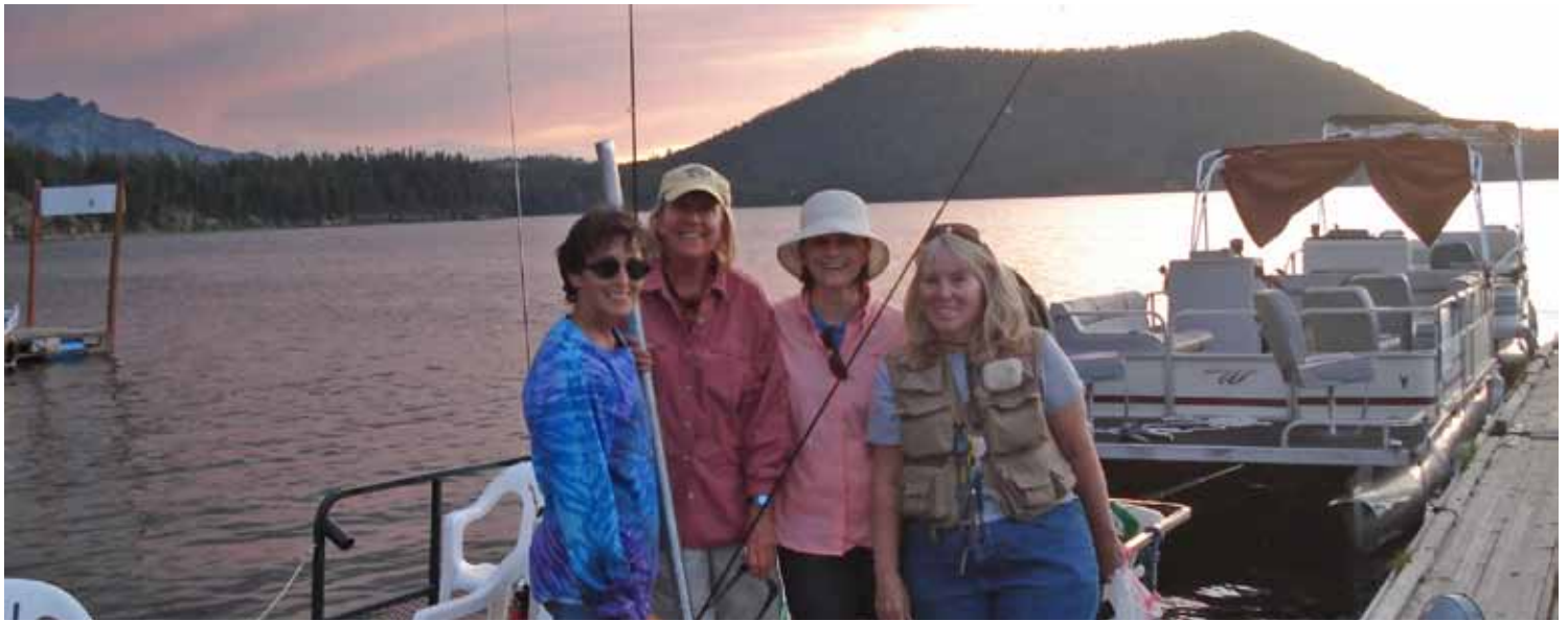
Wild Women of the Water at East Lake, August 2011.