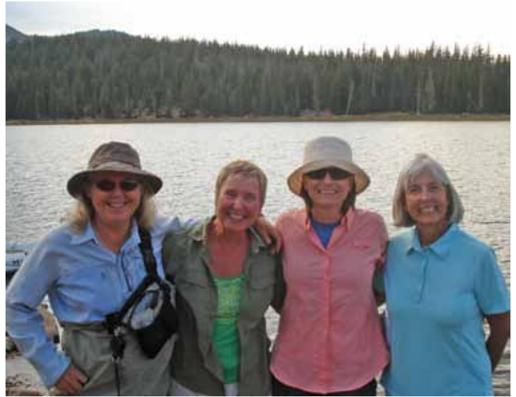
Wild Women at Three Creeks Lake, Sep 2011.