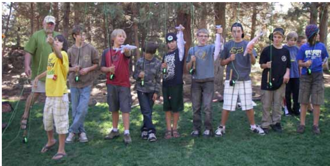
Students in the COF youth fly-fishing program at REALMS practice casting using rods purchased through Redington.