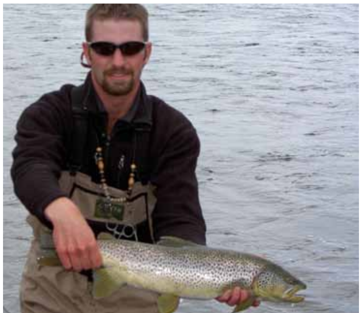
Fish caught on the Bow River Bugger.