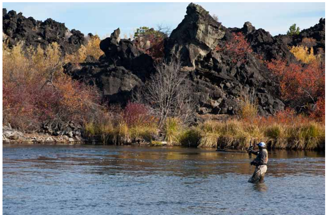
Team USA Flyfishing competition on the Deschutes River, October 2012.