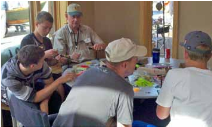
COF volunteers staffed a fly-tying table at the Sunriver Fly Fishing Festival.