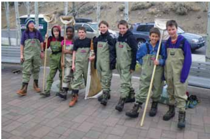
REALMS students in COF waders – ready for the river.

Next Cast Flyfishers is offering a summer fly-fishing camp through Bend Parks and Recreation. The camp will be June 18, 19, and 20, from 9:00 A.M. to 1:00 P.M. each day. The curriculum will also include knot tying, fly tying, bug collection and identification, casting and fishing in the ponds each day. The camp is listed in the Bend Parks and Recreation summer catalog to reach all of the area youth.