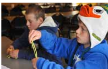
Kokanee Karnival Angling Clinic at Shevlin Park, April 2013.