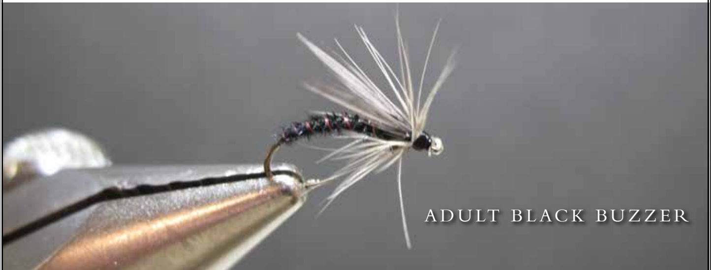
ADULT BLACK BUZZER

I know spring is just around the corner, it is just taking its time this year. It's a good thing because we have a low snow pack this year and we can use all the extra water we can get. With this in mind, there will be some low water issues later in the summer. So be aware; when the water warms up it is up to us to release fish properly, keeping them in the water, save the picture taking for some other time.