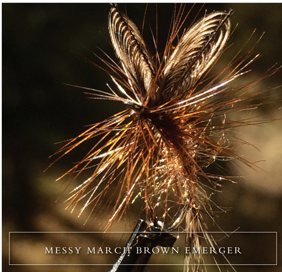
MESSY MARCH BROWN EMERGER