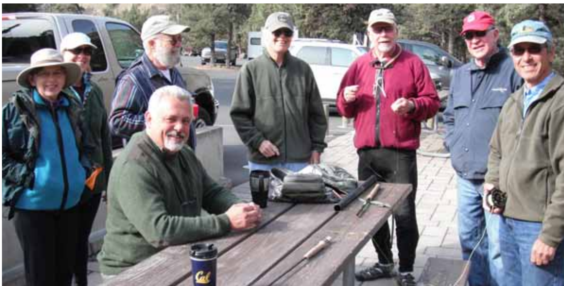
COF members on the Crooked River outing in May.

Wing: white or gray antron or Zelon or gray CDC or pearl Krystal Flash