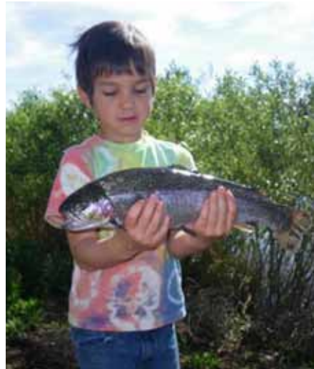
Little person catches a big fish at Bend Pine Nursery Pond during youth angling event in May.

– Jen Luke, ODFW STEP Biologist (541-633-1113)