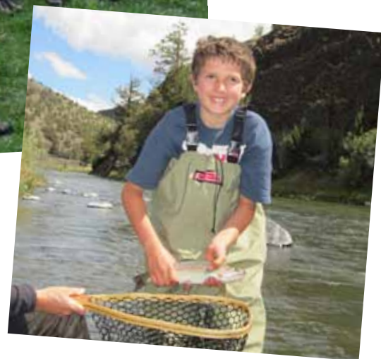
Students from REALMS on an outing to the Crooked River in May.