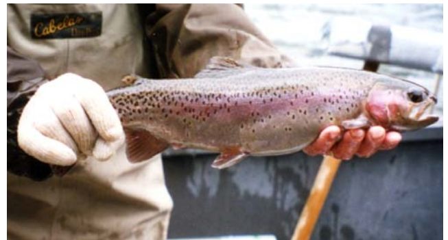
REDSIDE FROM CROOKED RIVER ELECTROSHOCK SURVEY