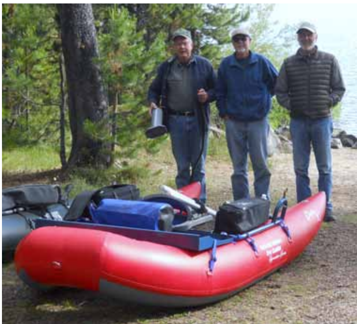
Crane Prairie outing, July 2011.