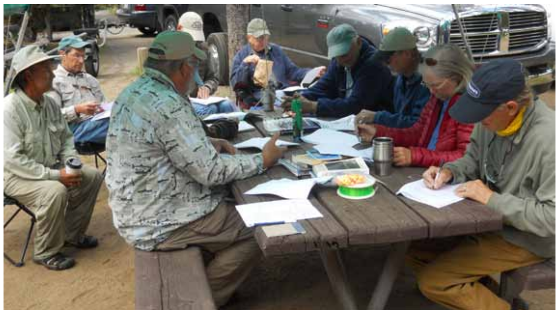
Crane Prairie outing, July 2011.