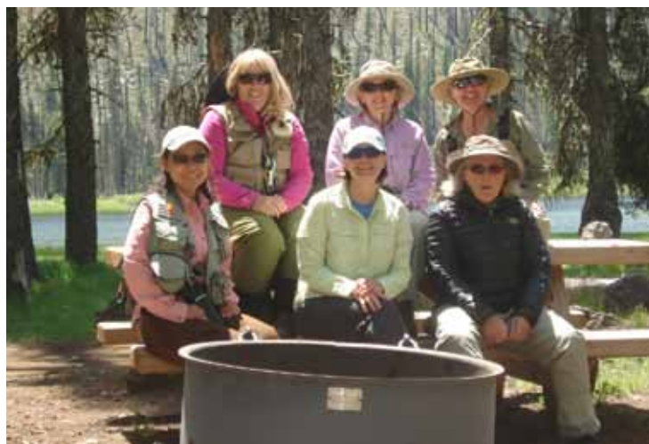
Wild Women enjoyed an overnight trip to Lost Lake.