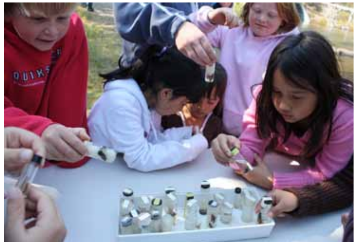
Students use aquaviewers (top) and inspect insect samples at the Nature's Restaurant station (bottom). Brown's Creek, 2008.