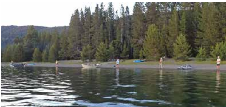
Next Cast kids reeling them in at East Lake.