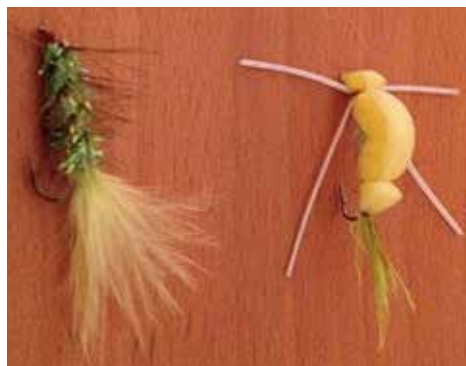
Two successful patterns.

To sign up for an outing, please contact the outings leader directly with a cc: to the outings coordinator at outings@coflyfishers.org . Email addresses and phone numbers are available on our website coflyfishers.org . Due to the nature of the water, some outings will have a limit on participation. Sign-ups will be taken on a first come, first served basis.