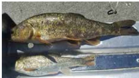
12 in chub.