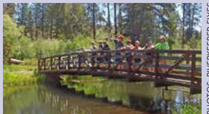
All the fly fishers ready to hit the pond.