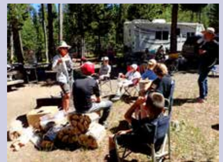
Next Cast Members Around Campfire.