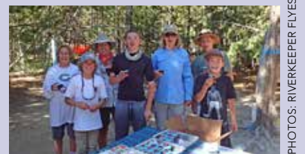
Next Cast Flyfishers 2017—Celebrating with Cupcakes.