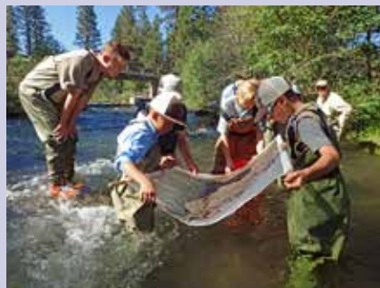
Collecting aquatic insects in Timalo Creek.